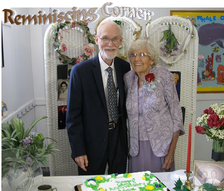
A beautiful picture of a wonderful couple. This was at their 62nd wedding anniversary. We miss you already. Love to you both from all of us.