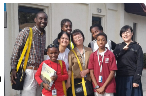
Cavassing Team with an SDA woman they met while cavassing at her job.