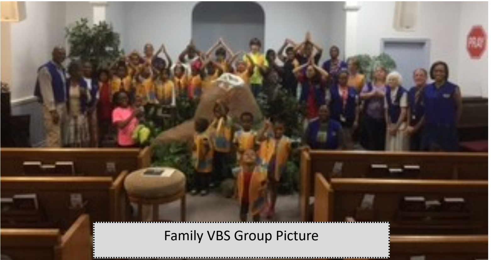
Family VBS Group Picture