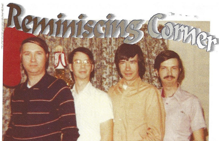
So who is this quarter? The King's Herald, The Faith for Today, The Statler Brothers, The Oakridge Boy's. No, these are four of our church members, can you identify them. Yes, this was years ago.